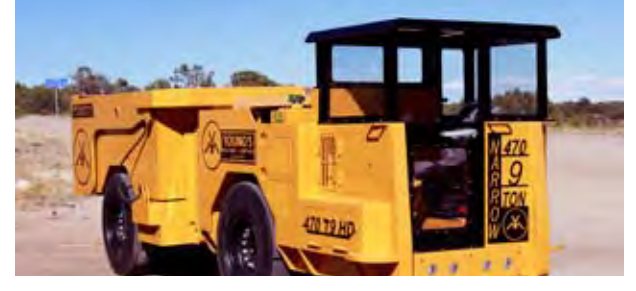
Volume struck 5.2 cubic yards, volume heaped 6.5 cubic yards