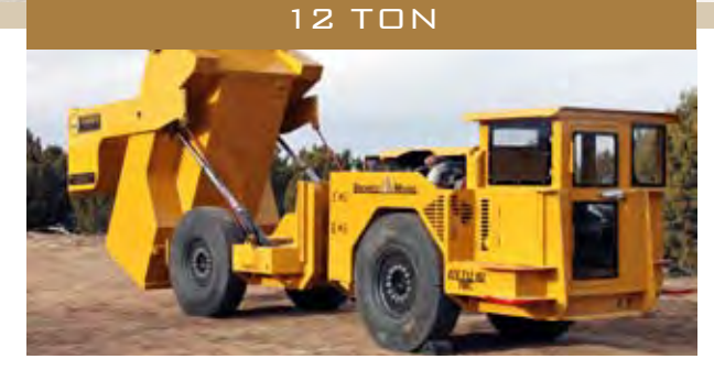
Volume struck 7.0 cubic yards, volume heaped 9.3 cubic yards