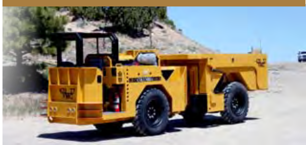
Volume struck 4.5 cubic yards, volume heaped 5.6 cubic yards